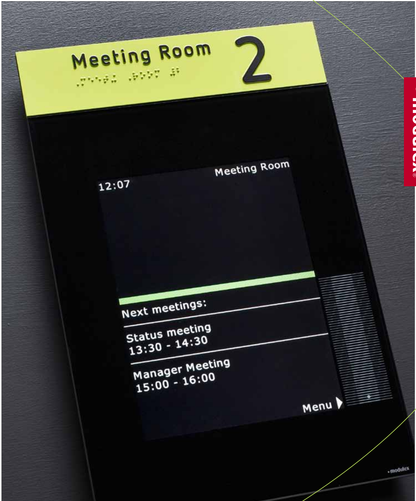
Facility View Interactive with tactile header