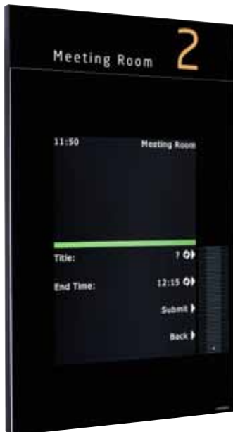
Facility View Interactive with top panel