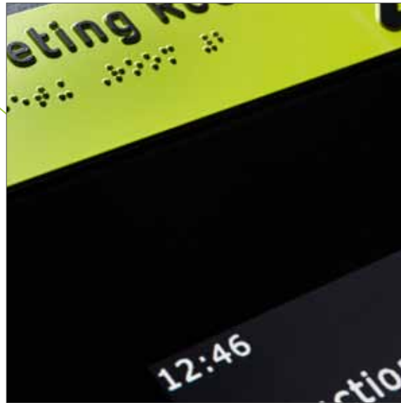
Facility View with tactile header