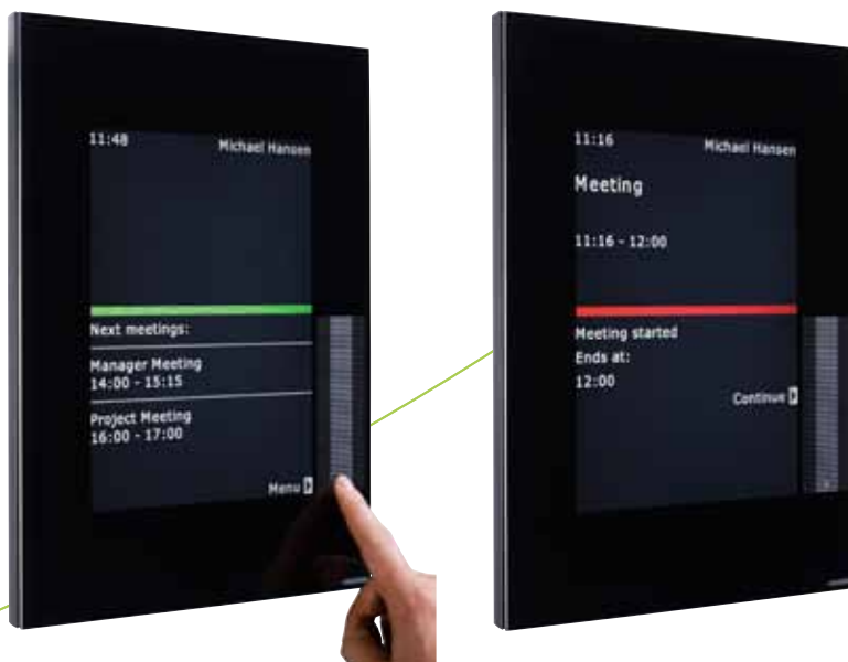
Facility View Interactive - green allows you to book or extend meeting - red means occupied

The background colour of the screen can be changed to suit specific requirements – for example to the company's logo colours. The text colour of the meeting information and menus can also be altered if required.